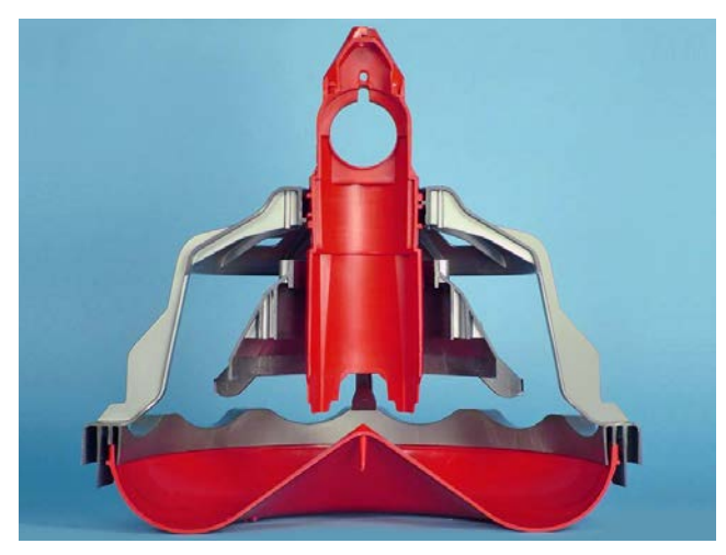
In the flood position, birds can easily see the flowing feed. The scalloped grill edge is just 2.5 inches (64 mm) at its lowest point.

What I like about Chore-Time's Liberty Feeder is the way I can adjust the flood level. I like that I can have a gradual change in flood level for my birds as they grow.