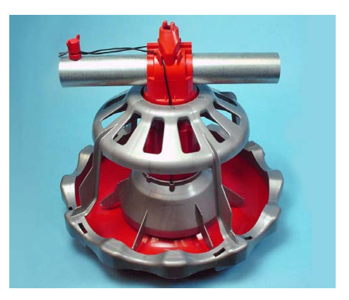
The LIBERTY<sup>®</sup> Broiler Feeder is offered with a silver feed cone . Mechanical and electronic control pans are available in both intermediate and end-control models.

Chore-Time's LIBERTY® Feeder features six feed level settings from 0.375 inches (9.5 mm) to 1.5 inches (38 mm) to control the amount of feed when the feed cone is in the lowered position.